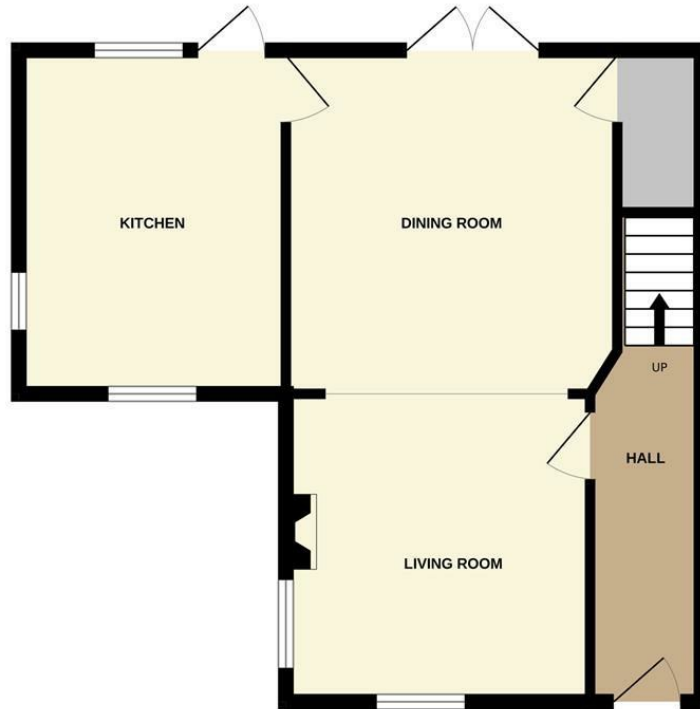
GROUND FLOOR 506 sq.ft. (47.1 sq.m.) approx.